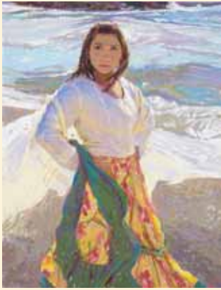
2009 Pastels USA Best of Show "Española" by William Hosner

Art Museum of Los Gatos 4 Tait Avenue at W. Main Street Los Gatos, CA 95031 408 354.2646