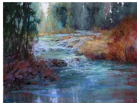
Pools by Willo Balfrey