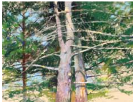
Sylvan Grace by Albert Handell