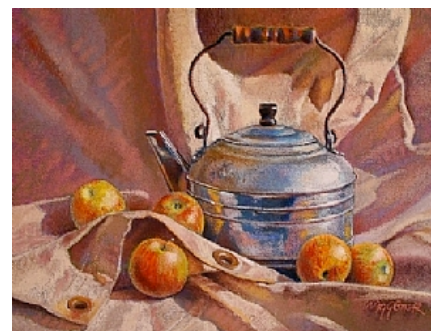
Harvest Tea Time Pastel on Paper · 18" x 24"

"2008 was a banner year for me. Having received awards for every juried show I have entered the internationally recognized Pastel Society of the West Coast recently