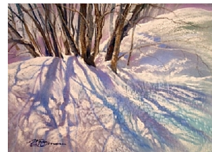
Silent Shadows Pastel on Paper · 11.5" x 16" · Private Collection

name me as one of their latest Signature Artists."